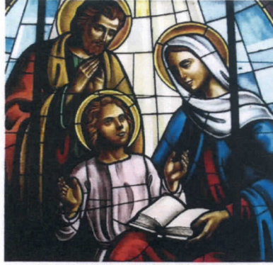
HOLY FAMILY - IMMACULATE CONCEPTION CATHEDRAL, EAST TIMOR