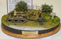
The engine pulling the train at the station in New Glen, Virginia, 1900. The engine is a 2-6-0 type.