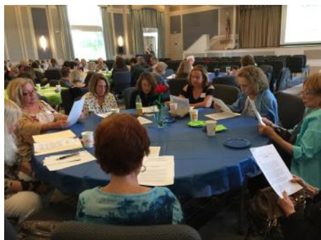
You Be the Judge Program