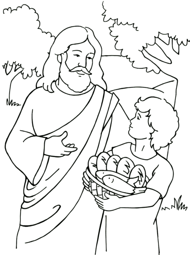
Jesus Feeds 5,000

From Thru-the-Bible Coloring Pages for Ages 4-8. © Standard Publishing. Used by permission. Reproducible Coloring Books may be purchased from Standard Publishing, www.standardpub.com .