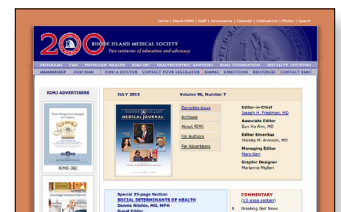
2. Contents webpage with ads [visit webpage]