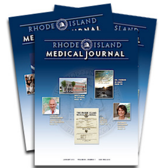
1. PDF of each issue [download an issue]

RIMS reserves the right to make the final decision on all advertisements.