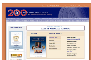
2. Sample contents webpage [click to view full size]