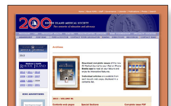
3. Archives page with ads [visit archives]