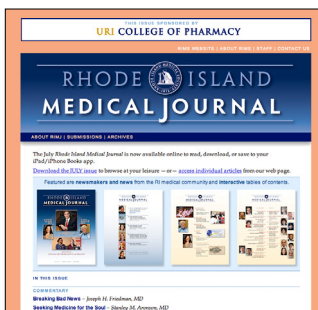
1. Sample distribution email [click to view full size]