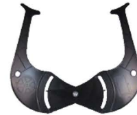
Rim Width Gauge 46FC77653