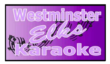
Feb. 3rd & 17th 7:30 p.m. to 10:00 p.m.