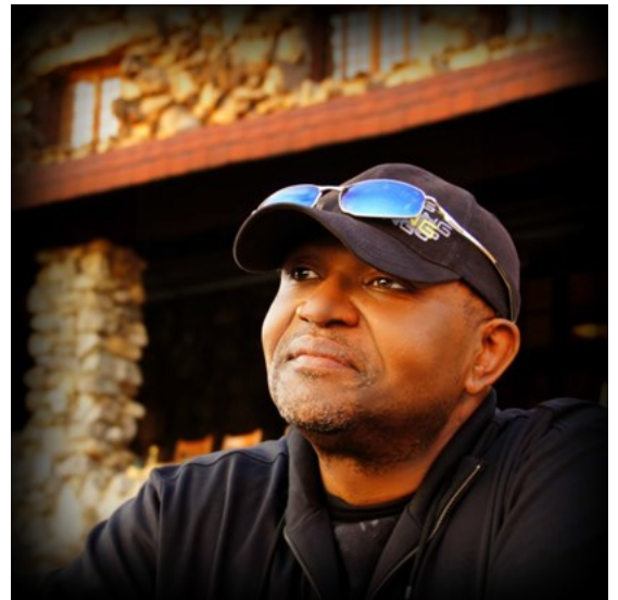
Pastor of Possibilities