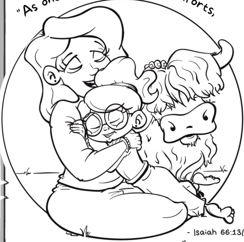
- Isaiah 66:13(a)