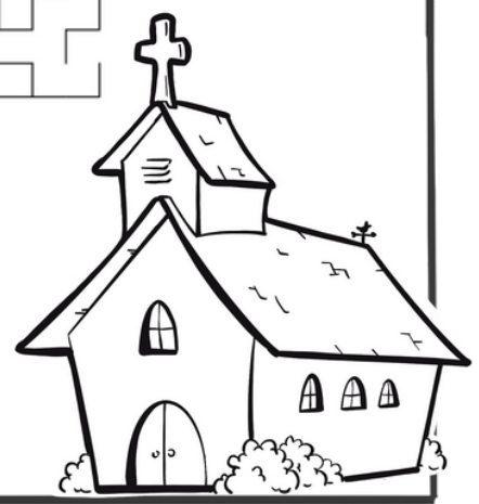
- Luke 10:2

"And he said to them, 'The harvest is plentiful, but the laborers are few. Therefore pray earnestly to the Lord of the harvest to send out laborers into his harvest."