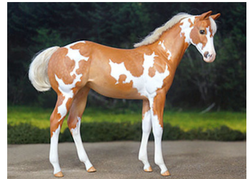
CHAMP FOAL: IMPRESSIVE LADY (CS)