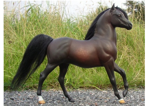
RES. CHAMPION REPAINT/HAIR OR SCULPTED M/T: AL OUSHIA (SN)

Simple Remake & Repaint w/Hair M/T: Trad. or Larger (9): 1-Nhi Vanye I Chyya (LoB), 2-Diamond Red Hawk (CM), 3-Hollywood Jaguar (SSu), 4-Milwaukee City (SSu), 5-Polaris (SSt), 6-Chief's Jersey Squire (SSu), 7-Tejas Little Eagle (CM), 8-Cutter's Pokey Pine (CM), 9-Summer Breeze (SSu)