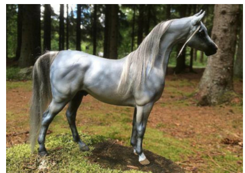
RESERVE CHAMPION LIGHT BREED: KALAA (SSt)

Thoroughbred (37): 1-Brimstone (JC), 2-Tetrasina (KW), 3-Temple Lord (SN), 4-Iron Eagle (SSt), 5-WBP Surprise Package (LeB), 6-In Lieu Of Cartier (BR), 7-Cast Iron Slew (AI), 8-Caspian (ShR), 9-Sun's Ask For Me (SN), 10-Super Trooper (JV), HM-Indian Pride (KO)