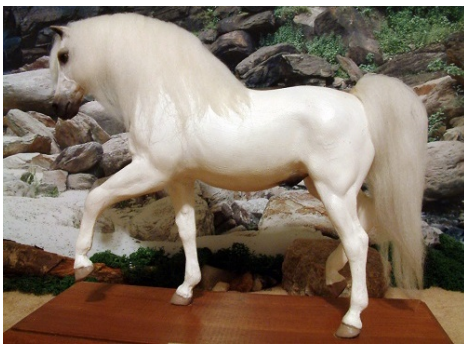
Tennessee Walking Horse (1): 1-Merry Mountain Mist