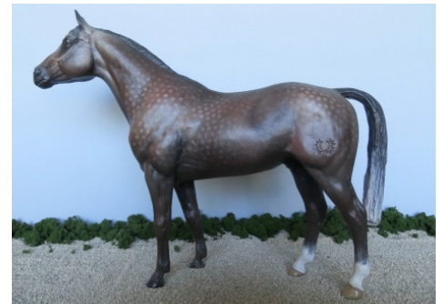
RESERVE CHAMPION SPORT BREED: KORSAKOV (CH)