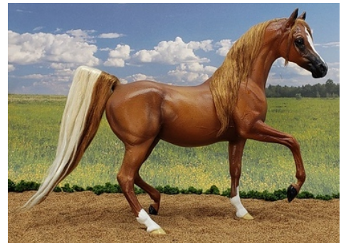
RESERVE CHAMPION BASE COLOR: AMARNA ANUKET (MW)

Dapple Grey (63): 1-Jamil Mhuratt (CR), 2-Mon' Nafa Rani (CR), 3-Loftus Jones (LoB), 4-Arahael (LoB), 5-Anise (BR), 6-Jetan's Glory (KO), 7-Grey Mercedes (SSu), 8-Sterling Silver (CF), 9-Khrystal Music (CH), 10-Zenith (LaD), HM-Smoke Bar Syndicate (CC)