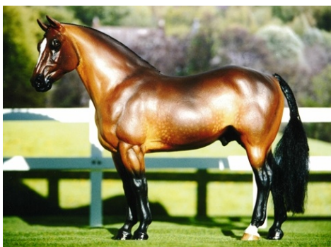
CHAMPION SPORT BREED: PR MURPHY BROWN (JV)

Other Pure or Mix Sport Breeds (24): 1-PR Murphy Brown (JV), 2-Wine and Roses (BR), 3-Parklane Oystercatcher (JV), 4-PR Rosie O'Grady (JV), 5-Schneidler (SSu), 6-DO Mirabeau Costello (JV), 7-I'm Impressed (SN), 8-Solid Citizen (CM), 9-Thayalini (JW), 10-Fiesta Time (SSt), HM-Mr Darcy (SN)