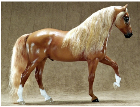
CHAMPION SPANISH BREED: ENCANTADOR (CM)