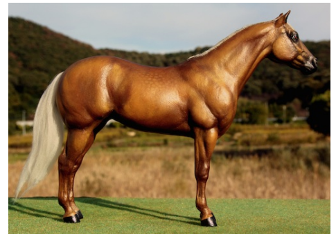
CHAMPION CREAM/DUN COLOR: GOLDEN MALICIOUS (SM)

Dun/Grulla (12): 1-Jemez Antigua (ShR), 2-Mo' Better Blues (JV), 3-TS Grassland Sunrise (MP), 4-Rob Roy (KW), 5-Ragnar Lothbrok (KW), 6-Speed Trap (AI), 7-MN Borg (LeB), 8-PF On-guard (KK), 9-Butterfly Kiss (JV), 10-Twist And Shout (SST)