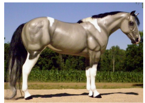
RESERVE CHAMPION PATTERNED COLOR: CEDAR HILL DUNCAN (VM)

CHAMPION PATTERNED COLOR: RAS NAVAJO DOVE (CM) [pictured at top of next column]