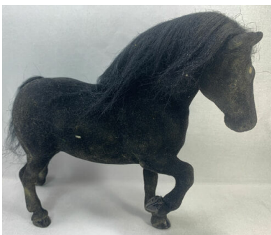
EBay, March 2022: British Columbia seller allinthemindtreasures' Breyer Trad. Belgian flocked and haired by unknown artist, believed to be pre-2000, auctioned to unknown buyer for Canadian $99.99.