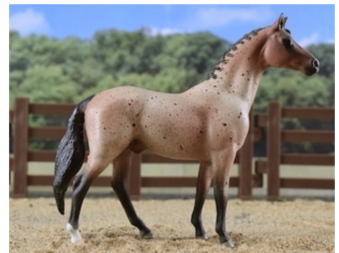
RESERVE CHAMPION PONY/MINIATURE HORSE: J'S SWEETBRIAR (AI)

Longear (6): 1-So Molson Canadien (SSu), 2-Ironwood Glenn (SSt), 3-Pam-