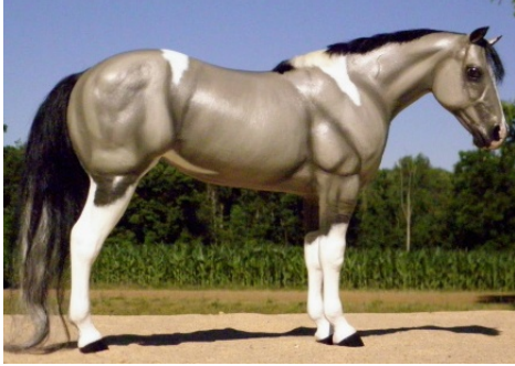
CHAMPION SIMPLE REMAKE/REPAINT/HAIR OR SCULPTED MANE/TAIL: RAS NAVAJO DOVE (CM)

Simple Remake & Repaint w/Non-Hair M/T: Smaller than Classic (3): 1-Going Formal (BR), 2-Precision (CH), 3-WV Cotton Top (AL)