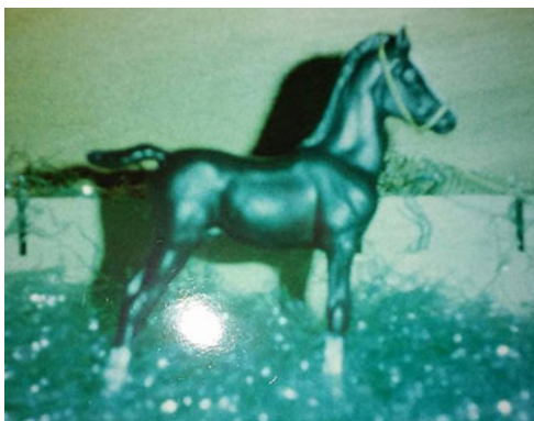
Light Breeds (1): 1-Bint Layla (KW)

Sport & Spanish & Draft & Pony & Longear/ Exotic/Fantasy Breeds : no entries