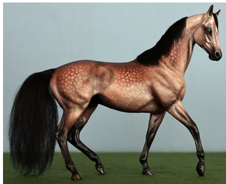
CHAMPION GREY/ROAN: INDIAN PRIDE (KO)

Roan (17): 1-Red Rebel (SSu), 2-DO Bessancour Moulin Rouge (JV), 3-WV Heza KO (LeB), 4-Me Bolido El Pastor (JW), 5-Wynstorm Gabriele (AI), 6-Cinnamon (SSu), 7-Moonlight SexPot (HC), 8-TS Lunar Eclipse (MP), 9-Judy Red Shoes (HC), 10-California Blue Bayou (AL), HM-Cat Ballou (JW)