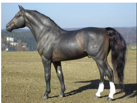
RES. CHAMPION SPORT BREED: AMANTUS VS (SN)

Paso Fino/Peruvian Paso (11): 1-Marquesa (CM), 2-Tesoro D Oro (JW), 3-TS Jalapeno (MP), 4-TS Crystal Conchita (MP), 5-Me Bolido El Pastor (JW), 6-LJ Abricotine Bleu (JV), 7-Noche Estrellado (SSt), 8-TD Khalife's Dee Dee (LeB), 9-Lad Amigo (HC), 10-PR Balenciaga Brio