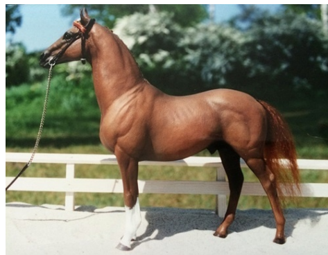
Stallions (7): 1-Sun's Oh Connor (SN), 2-Ar Sayyed (SN), 3-Gold Dust (CC), 4-Ebony & Ivory (CM), 5-Florentine (SSu), 6-Space Cowboy (SSu), 7-Scimitar's Ebony Flame (CM)

Gone But Not Forgotten: Vintage customs that no longer exist