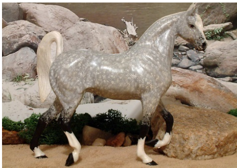
RESERVE CHAMPION GAITED BREED: CINDY LOU WHO (AP)