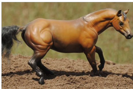
RESERVE CHAMPION CREAM/DUN COLOR: BOARDWALK JACK (SSu)

Blanket Appaloosa (48): 1-DQ Storm Warning (SSt), 2-Constellation (AP), 3-Montana Cat (LoB), 4-TS Vesuvius (MP), 5-TS Adirondack (MP), 6-J's Enchanted Ecco (AI), 7-Murphy's Law (AP), 8-Lady Luck (CS), 9-Classy Chassis (SSu), 10-Apache Magic Man (SSu), HM-Chances Are (ShR)