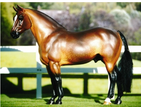
CHAMPION BASE COLOR: PR MURPHY BROWN (JV)

Black (15): 1-Vijelie Noptii (BR), 2-PHF Modesty Blaise (JV), 3-Dresden Blacque (BR), 4-Katana (SN), 5-Die Fledermaus (SSu), 6-Penant (JW), 7-Beltrane (ShR), 8-Dancer (HC), 9-PC Fergus (CM), 10-CL Fairway (HC), HM-KA Flight of Fancy (JV)