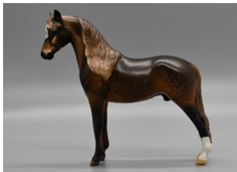
RESERVE CHAMPION EXTREME REMAKE/REPAINT/HAIR OR SCULPTED MANE/TAIL: MN LUGALIE (KK)

Flocked w/Flocked M/T and Remade & Flocked w/Flocked M/T: no entries