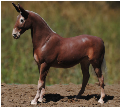
RES. CHAMP LONGEAR/EXOTIC/FANTASY: SO MOLSON CANADIEN (SSu)

Stock Breed Foal (30): 1-Meadow Star (SM), 2-Pretty Impressive (VM), 3-Class Action (CM), 4-KT Continental Rose (CM), 5-Little Bit Bar (SSt), 6-Samiga (LoB), 7-Tupelo Jones (LoB), 8-Foxy Humdinger (SSu), 9-Annie 84 (LoB), 10-Peppy Playboy (CS), HM-Tawny Wardlaw (LoB)