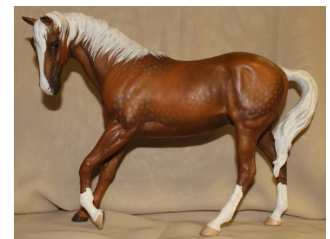
CHAMPION SPANISH: MATAR (LoB)

Other Pure/Mix Spanish (2): 1-Matar (LoB), 2-SD Conversano Diamond (AP)