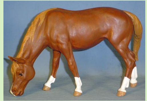
Candee 45 Years Old!

(Have one created in 1962, 1967, 1972, 1977, 1982, 1987, 1992, or 1997? Get it into the Birthday Barn spotlight by e-mailing its photo and info to our Gmail address below!)