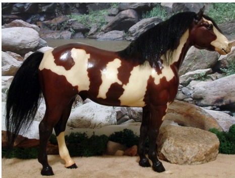
CHAMPION CUSTOM W/FACTORY PAINT: BARICZA (AP)

Remake and Retouch/Partial Paint Removal/Etch on Factory Paint with Non-Factory Mane/Tail: no entries