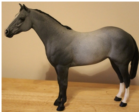
RESERVE CHAMPION STOCK BREED: POCO GRAYBAR (LoB)

Arabian (21): 1-*Rebel Bint Sahra (CH), 2- Jeddak's Rose (CH), 3-*The Raisuli (CH), 4-AI Dhahab al'Aswad (SM), 5-Nhi Vanye I Chyya (LoB), 6-AI Ouisha (SN), 7-Malika (SSSt), 8-Ancalime (KW), 9-Ibn Hotep (SSSt), 10-Fireo (NF), HM-Dark Desire (SSSt), Dragonquest's Desert Rose (SSSt)