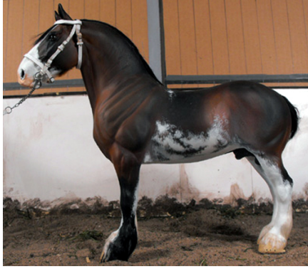
CHAMPION DRAFT BREED: SPARROWWOOD ROB ROY (SSu)

Pippilotta-Elmar (JV), 9-TS Lady Leeward Gem (MP), 10-WBP Lean On Me (IC), HM-So Farceur Sandman (KK)