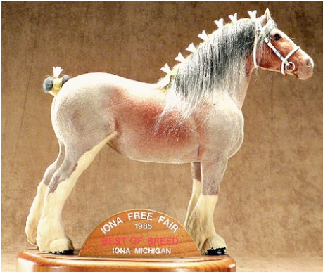
CHAMPION FLOCKED/OTHER CUSTOM: LADY OF TRIESTE (CM)

Any Other Customization Not Listed Above (6): 1-Hollywood Amber Lad (IC), 2-Antara Appalonia (LoB), 3-Khehana (KO), 4-Verano Sombra (SSt), 5-*Ardiente (CH)