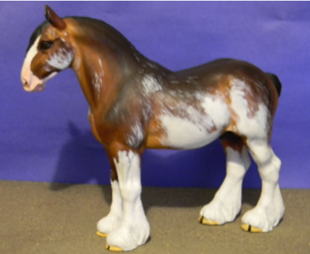
CHAMPION DRAFT: CEDAR HILL DUNCAN (VM)

Other Pure or Mixed Draft Breed (3): 1-*So Viktor Alexi (SuR), 2-Simmerl (SN), 3-Tuff Enough (CC)