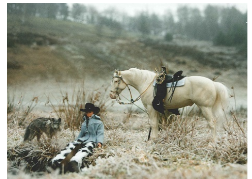
Scenes: Digital & 35mm Photo (8): 1-LBR The Pinkeyed Stallion: Frozen Prairie (RN), 2-LBR The Pinkeyed Stallion: Winter Prairie (RN), 3-LBR Kybele: Visiting Marbach (RN), 4-Regina Kashmir (BR), 5-Alamitos Ridge: Ride with Jace (RN), 6-Bluegrass Freckles: Cow Work (RN), 7-Whippoorwill Incognito (BR), 8-Carousel (HC)