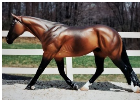
RESERVE CHAMPION STOCK BREED: NOVEMBER RAIN (BR)

Arabian (65): 1-Kalaa (SSt), 2-RAS Shiraz (KW), 3-Vijelie Noptii (BR), 4-KAS Dream Dancer (BH), 5-Ahvaz Wahaana (SN), 6-Walad (SN), 7-Gossamer Wings (KW), 8-Shammar Mokhtarah (SN), 9-Ahvaz Sawaalha (SN), 10-Warlord (NF), HM-Tech Noir II (AI)