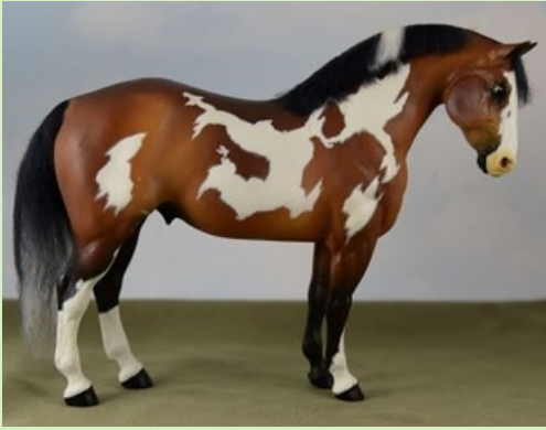
Alamance 35 Years Old!