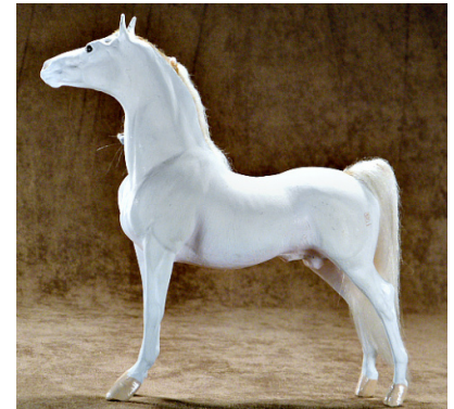
CHAMPION PONY/MINIATURE HORSE: BBG'S SILVER GHOST (CM)

Other Pure or Mixed Pony (12): 1-Condo Full Colour (AL), 2-Millers Golden Boy (AL), 3-Big Bang Theory (ShR), 4-Tug Hill Minstrel (CM), 5-Tug Hill Pied Piper (CM), 6-Althea (ShR), 7-Parkland Spartan (SH), 8-Southern Cross (CM), 9-The Country Girl (LK), 10-FS Snowfell (KO)