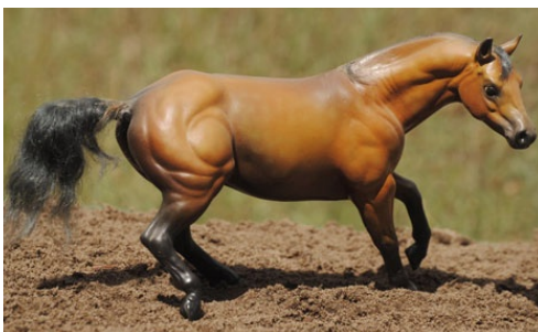
RESERVE CHAMPION STOCK BREED: BOARDWALK JACK (SSu)

Arabian (77): 1-Sweet Jane (LaD), 2-Mon'