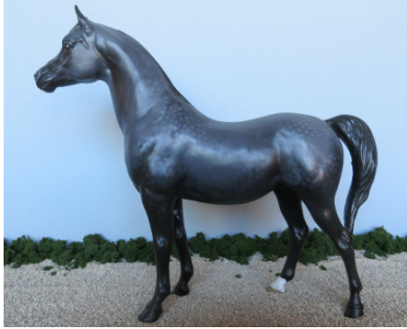
CHAMPION REPAINT: *REBEL BINT SAHRA (CH)

Repaint: Smaller than Classic Size (3): 1-Winds of Change (CH), 2-Wing'd Jaguar (SSu), 3-Rihanna (AP)