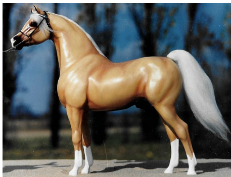
RES. CHAMPION MAJOR REMAKE/REPAINT/HAIR OR SCULPTED MANE/TAIL: SKS ARISTO KHAT (CM)

Extreme Remake & Repaint with Hair Mane/Tail: Trad. or Larger (83): 1-Valhallass Lyssa (CM), 2-Calendar Girl (LaD), 3-Grey Mercedes (SSu), 4-Miss Smokum Royal (CM), 5-White Treason (MW), 6-Empire's Fudge Sundae (CM), 7-So Supremely Fancy (AI), 8-Sterling Silver (CF), 9-Hunter (JC), 10-Foxcroft Lad (LK), HM-Legaciam (IC)