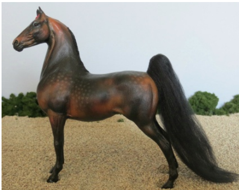
CHAMPION GAITED BREED: DARK COMMANDER (CH)

Other Pure or Mixed Gaited Breed (2): 1-Mr. Majestic (SSt), 2-Taxi Dancer (SSu)