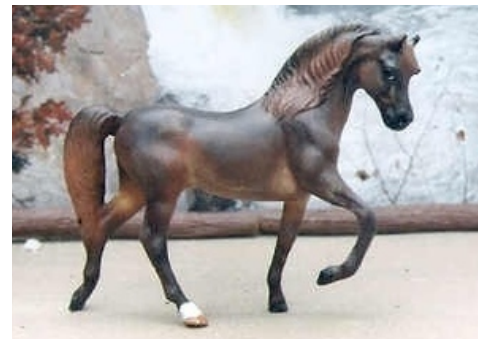
CHAMPION LIGHT BREED: MAXIMUM DOMINATION (IC)

Other Pure or Mixed Light Breed (8): 1-Carolina Girl (SSt), 2-TS Desert American Queen (MP), 3-Dream Theater (ShR), 4-Red Hawk (SSt), 5-KT Bunduki (RN), 6-LJ Hit It Hal (SM), 7-PR Malika Siglavia (JV), 8-WBP Abrianna (LeB)