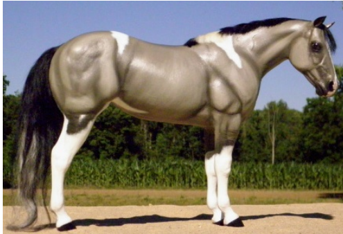
CHAMPION STOCK BREED: RAS NAVAJO DOVE (CM)

Other Pure/Mixed Stock Breed (7): 1-DQ Storm Warning (SSSt), 2-Moonlight Drive (LK), 3-Nabinabah The Bruce (CM), 4-Montana Cat (LoB), 5-Bourbon Express (SSu), 6-The Cimarron Kid (JV), 7-MJW Golden Nugget (ShR)