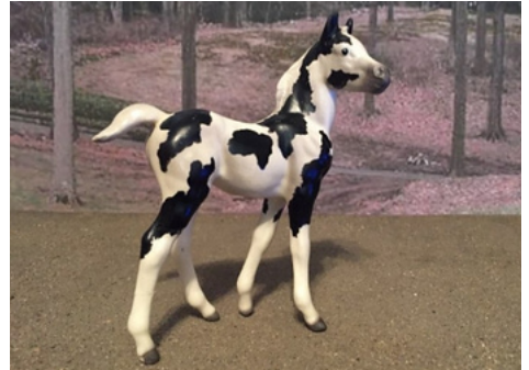
CHAMPION FOAL: JASPER (VM)

Spanish Foal & Draft Foal & Longear/ Exotic/ Fantasy Foal: no entries