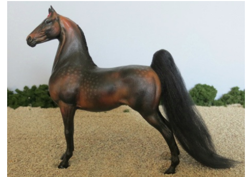
CHAMPION EXTREME REMAKE/REPAINT/HAIR OR SCULPTED M/T: DARK COMMANDER (CH)

Extreme Remake & Repaint with Non-Hair Mane/Tail: Smaller than Classic (5): 1-Anise (BR), 2-Whippoorwill Drop Dead Fred (BR), 3-LL Tidal Wave (SM), 4-DQ April Whisper (SSt), 5-Queen's Gambit (JC)