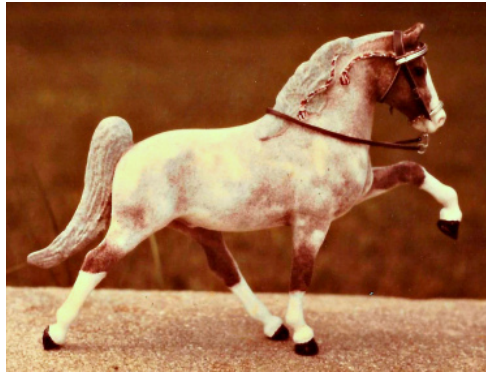
Gaited Breed (1): 1-Roaring Roan (CM)

Sport & Spanish & Draft & Pony & Longear/ Exotic/Fantasy Breeds : no entries