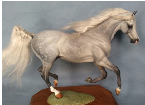
CHAMPION EXTREME REMAKE/REPAINT/HAIR OR SCULPTED MANE/TAIL: GOSSAMER WINGS (KW)

Extreme Remake & Repaint w/Non-Hair Mane/Tail: Smaller than Classic (16): 1-MN Lugalie (KK), 2-Wellsley (HC), 3-Jazz Ma'Tazz (KK), 4-Carolina Girl (SSu), 5-MN Borg (LeB), 6-Nafzieger (BR), 7-5 Mile Whiskey (BR), 8-Carolina Breeze (KK), 9-Concur (KK), 10-Falconleigh (JC), HM-PF Ongaard (KK)