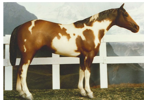
RES. CHAMPION CUSTOM WITH FACTORY PAINT: LBR RAINLIGHT (RN)

Repaint: Traditional or Larger (35): 1-Breezen (AI), 2-November Rain (BR), 3-Brimstone (JC), 4-Elusive Vision (SSt), 5-Lladtaymanta (SN), 6-Mr. Hanky Panky (LoB), 7-Libretto (SN), 8-BHR Salt Water Taffy (BP), 9-*Komment (SSt), 10-Jedi Moon (AI), HM-Pearl Essence (CM)