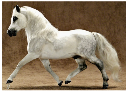
RESERVE CHAMPION LONGEAR/ EXOTIC/FANTASY: PEGI SOO (CS)

CHAMPION PONY/MINI HORSE: CAMELOT'S HOT T' TROT (CM) [pictured at top of next column]