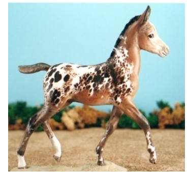
RESERVE CHAMPION FLOCKED/OTHER CUSTOM: GET YOUR GROOVE ON (JC)

1990s WORKMANSHIP DIVISION OVERALL CHAMPION: PR MURPHY BROWN (JV)