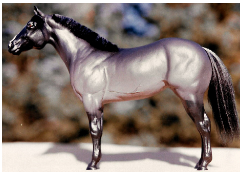
Mares (10): 1-Lonesome Dove (CM), 2-Ar Tayet (SN), 3-Nayef (SN), 4-Sun's Only For You (SN), 5-Wahaana (SN), 6-Romanadvoratrelundar (SSu), 7-Lady Glade (IC), 8-DQ Shiaway Jetta (CM), 9-Sherwood Peacock (CM), 10-The Iron Madam (IC)