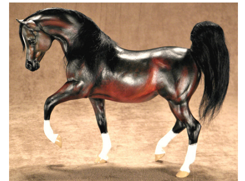
RES. CHAMPION EXTREME REMAKE/REPAINT/HAIR OR SCULPTED M/T: VALHALLASS LYSSA (CM)