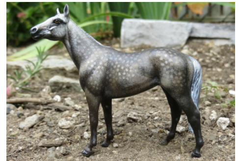
CHAMPION SPORT BREED: WINDS OF CHANGE (CH)

Other Pure or Mixed Sport Breed (3): 1-Wing'd Jaguar (SSu), 2-Flashover (SSSt), 3-Cotton Jenny (JW)