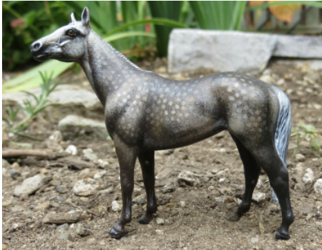
WINDS OF CHANGE

Shortly before press time, and without revealing who'd won what, owners of each division's Overall Champions and Reserve Champions were invited to share their thoughts about these star vintage customs. Here's what they said!