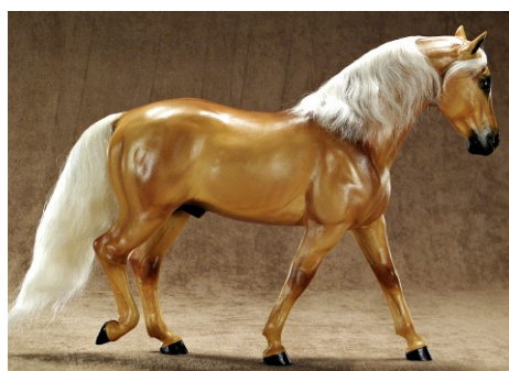
RESERVE CHAMPION GAITED BREED: FOXY MOONSHINE (CM)

Clydesdale/Shire (14): 1-Sparrowood Rob Roy (SSu), 2-Drambuie (BR), 3-TS Bonnie Red (MP), 4-RAS Elian Demoiselle (CM), 5-TS Annie Red (MP), 6-So JS Trade-off (SuR), 7-PR Burning Blue Soul (JV), 8-Amazing Heart (SN), 9-Rumneyhill Victoria (SN), 10-SR Mighty Mo (SSt), HM-D's Hillbilly Hollywood (VM)