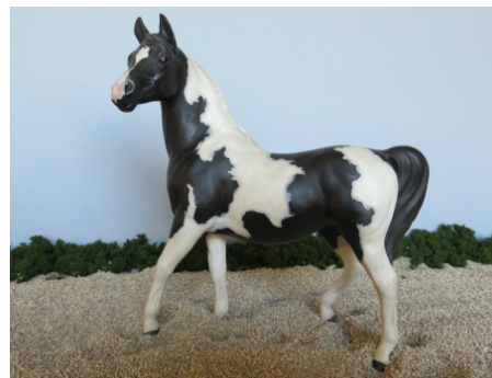
RES. CHAMPION LIGHT BREED: SOLAR QUEEN (CH)

Thoroughbred (9): 1-Winds of Change (CH), 2-Seaside Rendezvous (LK), 3-Frostfang (KW), 4-*Lord Fairfax (SSSt), 5-Town Crier (LoB), 6-Penny Arcade (BP), 7-Flying Fare (CM), 8-Teo Torriatte (LK), 9-Minstrel's Joy (AP)