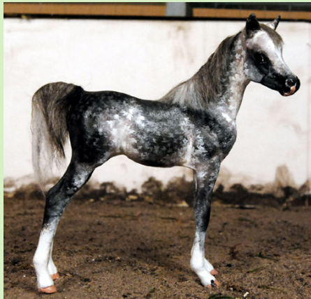
La Paska 30 Years Old!