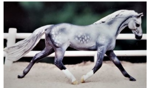
RESERVE CHAMPION SPORT BREED: ANISE (BR)

Paso Fino/Peruvian Paso (6): 1-Encantador (CM), 2-Trueno Azul (CM), 3-Danzante (AI), 4-Cancion De Amor (AP), 5-Diamond Majestad (CM), 6-Stephano (JW)