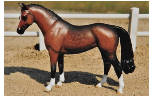
CHAMPION SPORT BREED: GOING FORMAL (BR)

Other Pure or Mixed Sport Breed (6): 1-Tug Hill By Design (CM), 2-Blank Stare (ShR), 3-Cherokee Rose (JV), 4-Jersey Boots (BP), 5-TS Fire on the Mountain (MP), 6-Bag Lady (LK)