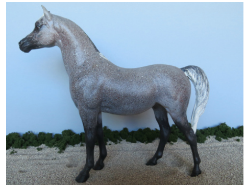
CHAMPION FLOCKED/OTHER CUSTOM: JEDDAK'S ROSE (CH)

Flocked w/Haired or Other Non-Flocked Mane/Tail (1): 1-Tug Hill By