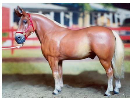
RESERVE CHAMPION OTHER COLOR: JEB (SSu)

1990s COLOR DIVISION OVERALL CHAMPION: INDIAN PRIDE (KO)