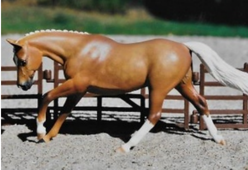
CHAMP MAJOR REMAKE/REPAINT/HAIR OR SCULPTED MANE/TAIL: IN LIEU OF CARTIER (BR)

Major Remake & Repaint w/Non-Hair M/T: Smaller than Classic (9): 1-In Lieu of Cartier (BR), 2-Vijelie Noptii (BR), 3-Cast Iron Slew (AI), 4-Northern Exposure (BR), 5-Cast Iron Bull (AI), 6-Majestic Ziggy (AL), 7-WBP Jolly Roger (LeB), 8-Marshdale Gold Rust (AL), 9-Ridley (LK)