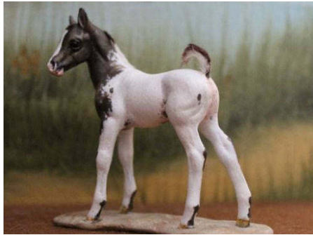
CHAMPION FOAL: MEADOW STAR (SM)

Longear/Exotic/Fantasy Foal (1): 1-J's Dandyllion (AI)