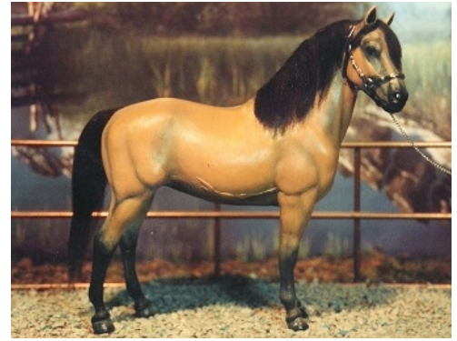
Betelgeuse (SSu), 7-Excel (JP), 8-Riff Raff (SSu), 9-Mountain Knight (CC), 10- Death Star (SSu), HM-Duke Nukem (SSu)