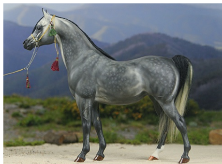
RESERVE CHAMPION LIGHT BREED: MON'NAFA RANI (CR)

Thoroughbred (32): 1-Going Formal (BR), 2-Flying Tiger (KO), 3-Jetan's Glory (KO), 4-Heyday (KO), 5-Hearts-