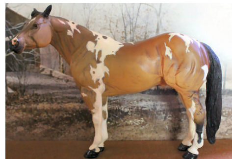
CHAMPION CUSTOM WITH FACTORY PAINT: SERGEANT PEPPER (HC)

Retouch/Partial Paint Removal/Etch on Factory Paint w/Non-Factory Mane/ Tail and Remake and Retouch/Partial Paint Removal/Etch on Factory Paint w/Non-Factory Mane/Tail: none