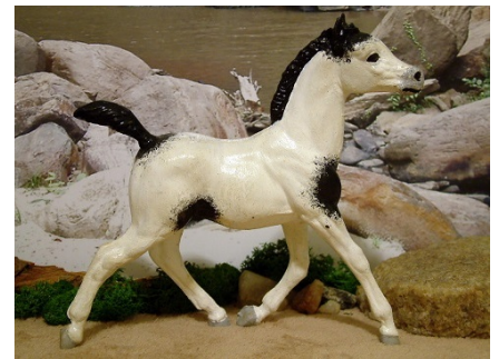
RES. CHAMP FOAL: LOVE GUN (AP)

1960s/'70s BREED DIV. OVERALL CHAMP: WINDS OF CHANGE (CH)