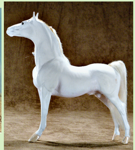
BBG's Silver Ghost 40 Years Old!