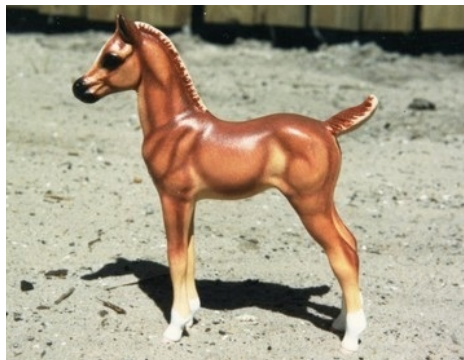
RES. CHAMPION FOAL: CHARISMA (CC)

1980s BREED DIVISION OVERALL CHAMPION: DARK COMMANDER (CH)