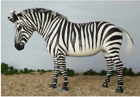
CHAMPION LONGEAR/EXOTIC/FANTASY: J'S TIGER LILY (AI)