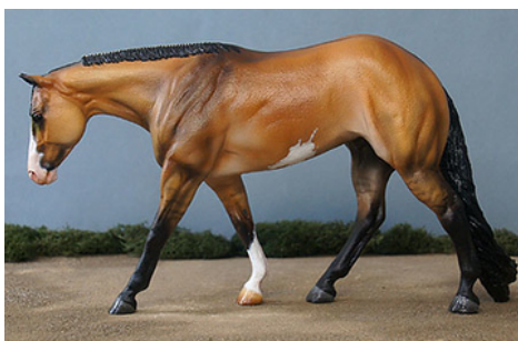
RESERVE CHAMPION PATTERNED COLOR: AUTUMN GOLD (CS)

Longear/Exotic (33): 1-Get Your Groove On (JC), 2-Jeb (SSu), 3-Out Of Africa (JC), 4-MN Hootn Nanny (KK), 5-Chloe (CS), 6-Doodah (KK), 7-Rebel Yell (RN), 8-Pegi Soo (CS), 9-Slightly Scarlett (HC), 10-DA Bardigano Honest John (JV), HM-Zambezi (KW)