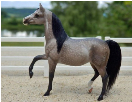
RES. CHAMPION SIMPLE REMAKE/REPAINT/HAIR OR SCULPTED MANE/TAIL: BLESSED WINE (BR)

Major Remake & Repaint w/Hair M/T: Trad. or Larger (81): 1-Jamil Mhuratt (CR), 2-SKS Aristo Khat (CM), 3-Boardwalk Jack (SSu), 4-*So Viktor Alexi (SuR), 5-Bonnie Blue Butler (IC), 6-Ahvaz Orishahn (SN), 7-Sweet Jane (LaD), 8-Tuxedo Kamen (AI), 9-Dakota Shyster (LoB), 10-Silver Xanadu (AL), HM-Hollywood Starlette (CM)