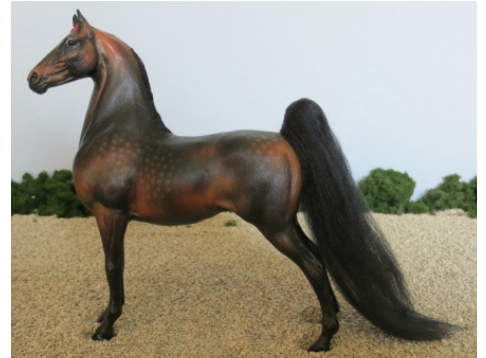
CHAMPION BASE COLOR: DARK COMMANDER (CH)

Black (11): 1-TS Elegant Gypsy (MP), 2-Business As Usual (SSt), 3-Midnight On Parade (CM), 4-PX Le Corbeau (JV), 5-Indiana Lawman (LoB), 6-Sun's Quatach (SN), 7-Blackhawk (AP), 8-So Supreme Threat (CM), 9-Akhu (AL), 10-Athena (AL)