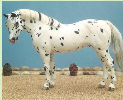
Kuato 25 Years Old!

CM by Sue Sudekum in 1992 Owned by Sue Sudekum