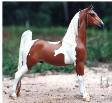
CHAMPION GAITED BREED: SULTAN OF SWING (JC)

Other Pure or Mixed Gaited Breeds (11): 1-Foxy Moonshine (CM), 2-MN Lugalie (KK), 3-Ima Travelin' Man (CM), 4-TS Galilean Dragoness (MP), 5-Sparkling Chablis Z (CM), 6-Lighen Up Jack (HC), 7-TS Autumn Nor'easter (MP), 8-PopRocket (HC), 9-Thumbs Up (HC), 10-Glitters Like Gold (JV), HM-Hit The Switch (SSu)