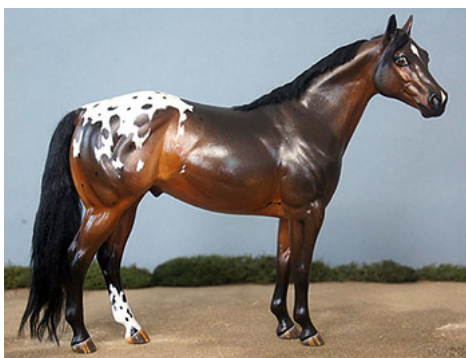
CHAMPION PATTERNED COLOR: RIO GRANDE (CS)

Other Pinto Patterns (61): 1-Autumn Gold (CS), 2-Looks Can Kill (RN), 3-Breezen (AI), 4-Sparrowood Rob Roy (SSu), 5-Blackberry Lane Notorious (ShR), 6-Harmonium (LK), 7-Lucky Doll (AI), 8-Special Print (RN), 9-Jazz MaTazz (KK), 10-Fair Isle (LK), HM-Bulletproof (AI)