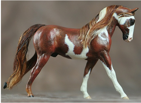
RES. CHAMPION SPANISH BREED: IMA BELIEVER (CR)

American Saddlebred (19): 1-Dark Commander (CH), 2-Calendar Girl (LaD), 3-Grey Mercedes (SSu), 4-Business As Usual (SSt), 5-Crimson Queen (ShR), 6-DQ's Razzle Dazzle (IC), 7-Diamond Sungold (AP), 8-Personal Effects (LaD), 9-Love N' Flames (CH), 10-LL Tidal wave (SM), HM-Black Tie Affair (SSt)