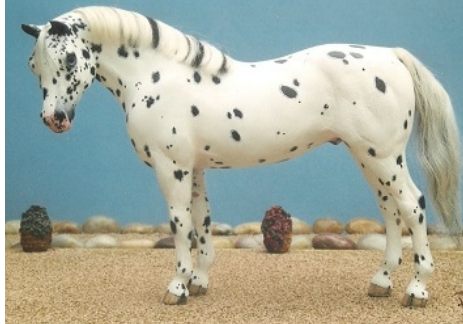
RESERVE CHAMPION PONY/MINI HORSE: KUATO (IC)

Longear/Exotic/Fantasy Foal (8): 1-Out Of Africa (JC), 2-Get Your Groove On (JC), 3-SP Baby Blues (KC), 4-Chloe (CS), 5-Beakman (SSu), 6-Zenda (JP), 7-Grits (BH), 10-Jewels (HC)