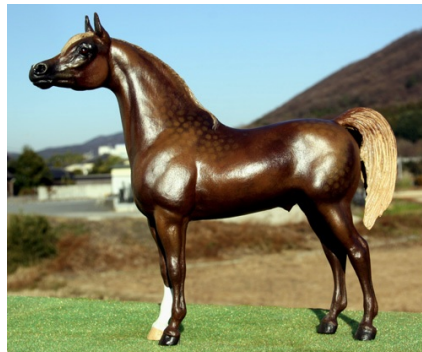
RESERVE CHAMPION REPAINT: AL DHAHAB AL'ASWAD (SM)

Repaint w/Hair M/T: Trad. or Larger (17): 1-Dane Tyler Bennington (LoB), 2-Ibn Samekh (AP), 3-Milwaukee Rascal (SSu), 4-Minstrel's Joy (AP), 5-Lakota Diamond (EH), 6-Paisano (NF), 7-Cayenne's Cyette (SSu), 8-Bint Kareyma (SSt), 9-Malika (SSt), 10-Red Eagles Snow Leopard (SSu), HM-Tex-Sun's Rosita (SSu)