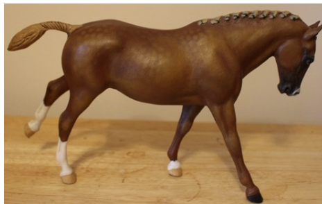
CHAMPION PONY/MINIATURE HORSE: HI HO HASTINGS (LoB)

Miniature Horse and Other Pure or Mixed Pony Breed: no entries