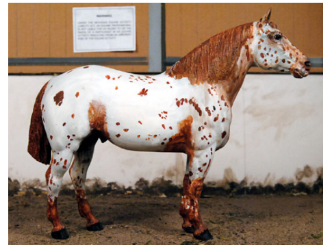
RES. CHAMPION FLOCKED/OTHER CUSTOM: INTREPID KING (SSu)

1960s/1970s WORKMANSHIP DIV. OVERALL CHAMPION: *REBEL BINT SAHRA (CH)