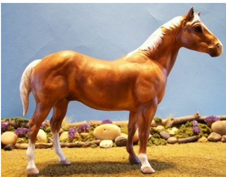
RES. CHAMPION FLOCKED/OTHER CUSTOM: HOLLYWOOD AMBER LAD (IC)