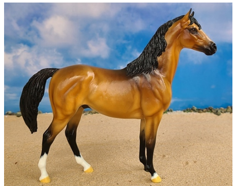
RESERVE CHAMPION CREAM/DUN COLOR: NEMESIS (LeB)

Blanket Appaloosa (51): 1-Rio Grande (CS), 2-I'm Impressed (SN), 3-So Pro-toge (KK), 4-Ima Rock-a-teer (CM), 5-Schneider (SSu), 6-Simply Southern (RN), 7-Witchy Woman (RN), 8-LJ Wai-kikamkau (AL), 9-Ella Enchanted (AI), 10-Sunny Beach (CM), HM-Heza Hobo (HC)