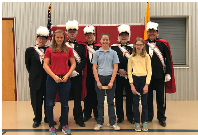
Knights of Columbus Middle School Essay Winners