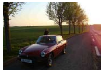
Route Nationale with typical French scene

locked: an omen of failures to come over the next 1000 miles? Up reared the concerns that my girlfriend Ele – who until then had been supportive – was quietly dreading. The clothes-peg that I use on the choke was moved to prevent the seatbelt coiling back, and a rapid lunch with parents plus a full load of PG Tips sustained us until Folkestone.