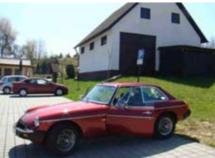
A break from the autobahns in Germany

'This car is fantastic for long-distance touring, but push it and you can feel how rapidly technology has progressed'