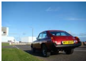
Powerhouses: MG and Torness nuclear plant

The MGB GT V8 reaches Italy at last after an epic homecoming trip – no wonder McNaughton Gisby looks so happy