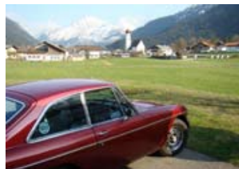
Touring Austria, in the shadow of the Alps