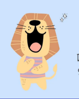
What did one math book say to the other? Don't bother me! I've got my own problems.

There may be a local Mu Alpha Theta chapter that can collaborate with your chapter on Pi Day activities, study sessions, field trips, and much more. Some Mu Alpha Theta chapters host "Mini Mu" competitions, where they organize a math competition for middle schoolers.