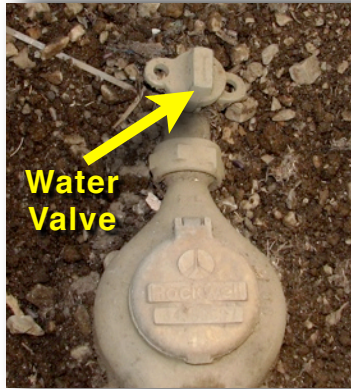
2) Place T Wrench on Protruding Rectangular Water Valve