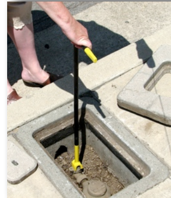
3) Use T wrench to rotate valve one-half turn clockwise