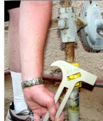
3) Rotate Valve 1/4 turn counterclockwise