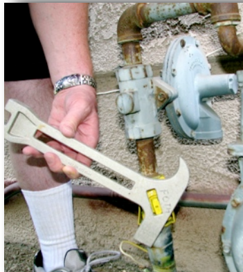
2) Remove Wrench and Place on Gas Valve