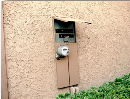
1) Locate Electrical Panel on the West side of house and open