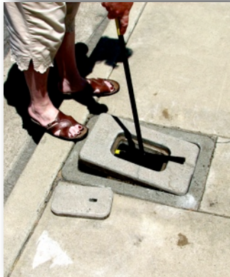
1) Locate Water Valve on Front Curb. Remove Covers with "T" Wrench