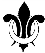
Mount Pleasant CDC