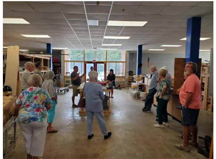
First Baptist Church's Missions Committee organized a visit to tour Charity Rebuild Center in Rose Hill on May 29, 2021.