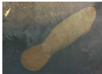
Close-up of Junior. Looks nice & healthy