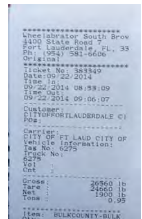
The ticket from the weigh station when the city truck unloaded Monday morning: 1900 pounds of trash!

Thanks for supporting our Waterway Cleanup: Publix Edco Awards & Specialties Ft. Lauderdale Parks & Recreation Lauderdale Isles Yacht Club Lauderdale Isles Civic Improvement Association Ft. Lauderdale Environmental Services Atlantic Coast Rebuild Sailorman