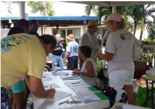
The registration desk was busy signing in Volunteers & handing out T-shirts