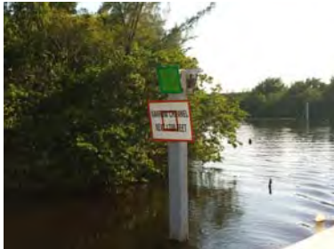
The first new marker as you head into the dangerous stretch.

Now that we're headed into winter, quite often the seas on the outside are fairly rough, especially on the weekends. A popular alternative cruise for a Saturday afternoon is the "Circle Route" through the "woods" (technically the South New River Canal), to the Dania Cut Off Canal, to the ICW, north to the New River, and up the River back to the Isles. It's a nice leisurely cruise, and there are plenty of restaurants where you can stop for lunch. The one tough spot to navigate has always been right after you pass under the I-595 bridge as you start to enter the woods. Lousy PVC pipes for markers, and lots of rocks where you can see that plenty of boaters have damaged their props. But not any more. Recently, concrete pilings have been installed in this dangerous stretch to make traveling through much easier.