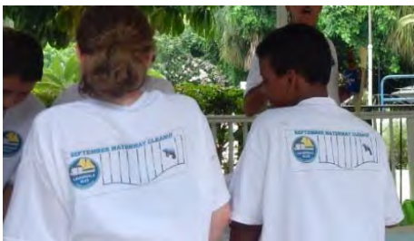
The T-shirts with the Waterway Cleanup Logo were a big hit.