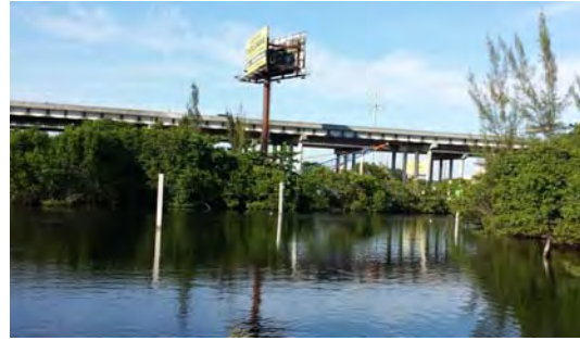
There are about a dozen of these new concrete pilings to guide you safely past the shallow rocky shoals.