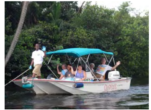
Headed out to start cleaning up