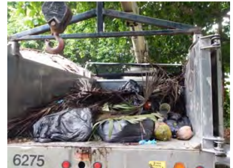
The truck donated by the City Parks & Recreation Dept. starts to fill up at 10:00am.