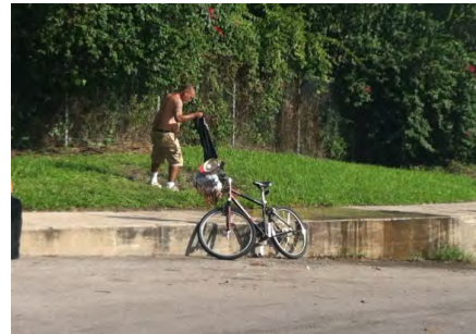
Bathing at boat ramp faucet

Fort Lauderdale Police Department (FLPD): Although it took a few months, FLPD has really stepped up their patrols and have been very responsive to resident calls about homeless activity. Please note that homelessness is not a crime. FLPD can ask vagrants to leave the park, and sometimes they move on. However, if vagrants are breaking the rules (alcohol is prohibited in both parks mentioned above), FLPD can force them to leave or arrest them. FLPD is also very responsive to volatile behavior. FLPD is unable to assist with any activities under the bridge because it is not their jurisdiction.