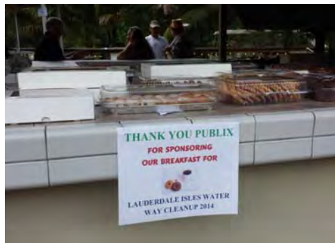
Publix graciously donated all the breakfast goodies