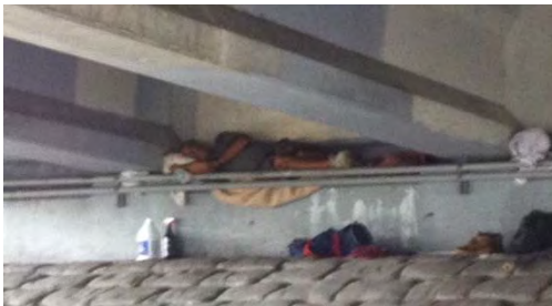
Sleeping under 441 bridge

To address this dangerous situation, I have involved several government agencies: