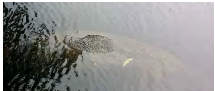
Mom surfacing. They'll enjoy the winter in paradise with us.