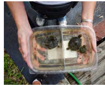
Very unique find: Rare New River Green Diamondback Turtles, found within palm fronds pulled from the river. These were carefully returned to the environment, before someone started thinking about turtle soup.