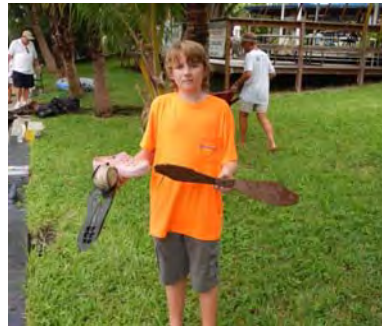
Unique item found: Old wooden airplane propeller. The experts present said this was from a plane that crash-landed in the New River in 1918. Being sent to the Smithsonian for analysis