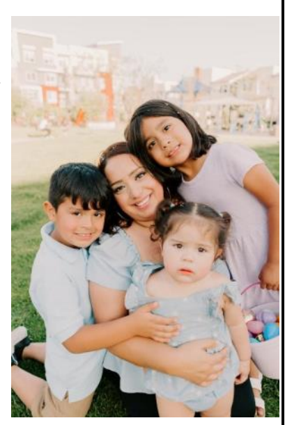
This family was the recipient of the Auxiliary Christmas wish.

A shout out to the ladies who do the bake sale, and to those that donate the goodies it has been a great success. That's all for now. Feel free to contact me if you have any questions or concerns.