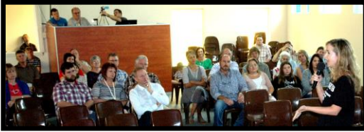
Ellisras - Agape Kerk