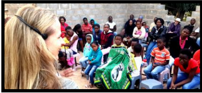
White River – Kabokweni

We covered Botswana, Limpopo and Mpumalanga visiting most of their large towns after invitation to different venues.