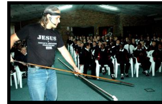
Ermelo – Christn Sch

WHY? Because of his enlightenment through the Holy Spirit Paul avoids possible hindrances and bypasses opposition to bear testimony of salvation through JESUS CHRIST.