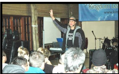
Middelburg – Kingdom LC