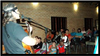
Botswana - Lobatse

We're presently near you on our way to the USA and Canada and will be staying until the end of November. Please feel free to invite us - it will be a pleasure to witness at a venue of your choice. Email us: amazonmissions@gmail.com