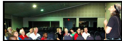
Pietersburg – Baptist Seminary