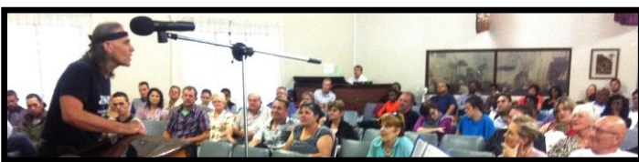
Hazyview – Lighthouse Christian Church