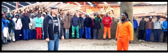
Lothair – Saw Mill

areas filled with eastern and foreign shop owners. PEOPLE CANNOT BE SAVED FROM HELL BY JESUS CHRIST IF THEY'RE NOT TOLD!