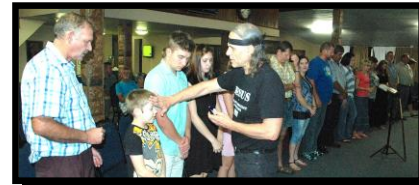
Thabazimbi – Oase AGS

Our presentation focusses on surviving stone-age tribes , the last to encounter civilization. Contact is inevitable as fortune hunters ravage the jungles but God has a plan . Through such forced contacts the tribes may have a chance of hearing the GOOD NEWS of JESUS CHRIST and get saved.