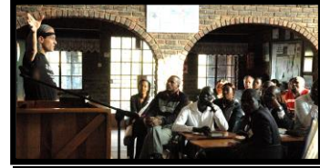
Barberton – Bible TC

The emphasis was to, “GO AND REACH PEOPLE,” starting in our local communities with prisons, hospitals etc., dishing out Bible tracts on the streets and going to the market