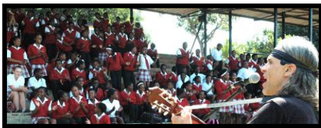
Tzaneen – Ben Vorster HS

In Dec 2015 to Jan 2016, there is a 4 week Amazon trip for those of you who are interested. You fly either to Lima or Bogota (The final decision to which city will be made known later), where we will pick you up and take you further. What do you owe us? Nothing, but we ask that you sow that month's tithe to