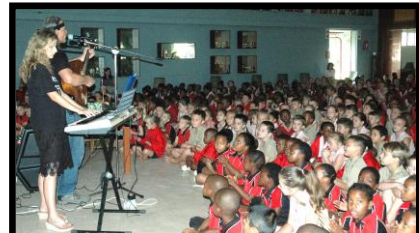
Phalaborwa – Rooi Skool

Just for interest sake 33% of the people who partake normally go full time after such a trip. Contact us for more detail. You do not need to prepare a lot and most of the gear you will need is obtained this side. You don't have to feel called. Just come. ☺