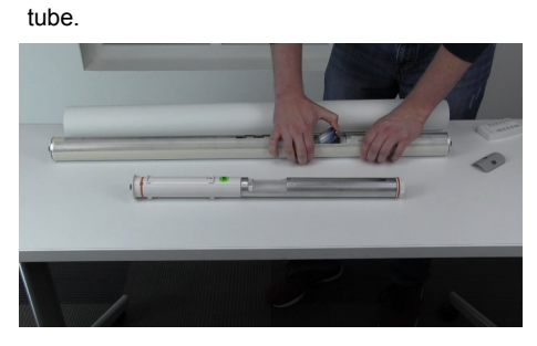
Step 8 Pull the Motor Control Assembly out of