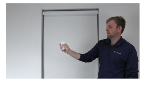
Step 2 Remove shade from the window brackets.

Click the UP button to roll shade up to the full open position.