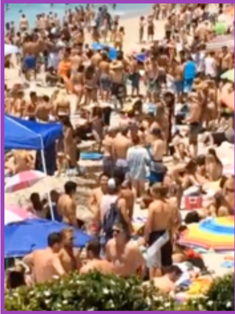
2014 Rave Party

.... The area south of Sea Lane has always been difficult to patrol because it curves in just enough that the police cannot see it from the railing on Marine Street and the lifeguards can not see it from their chair. This leads to a small little cove for activities to transpire that are not becoming to the families enjoying the beach. The homeowner organized a group of individuals to pay for a private security guard to patrol the area. It made a huge difference in keeping the beach family friendly this summer.