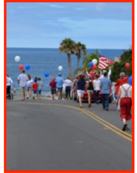
4th of July Paraders