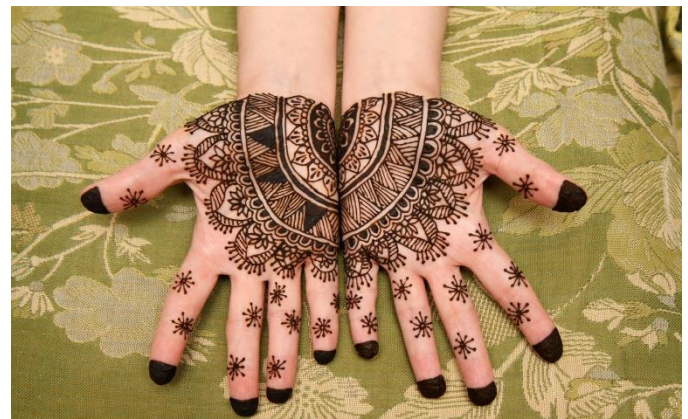
From clipart – a sample of henna art