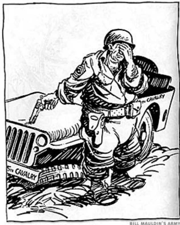
BILL MAULDIN'S ARMY