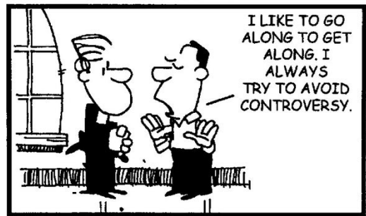
PRESENTATION OF THE LORD