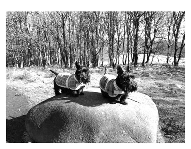
Double Scotch on the Rocks

An old man going a lone highway Came at the evening, cold and gray, To a chasm and deep and wide, Through which was flowing a sullen tide. The old man crossed in the twilight dim: The sullen stream had no fear for 'im But he turned when safe on the other side And built a bridge to span the tide. "Old man," said a fellow pilgrim, near, "You are wasting strength with building here; Your journey will end with the ending day; You never again will pass this way; You've crossed the chasm, deep and wide Why build you this bridge at the evening tide?" The builder lifted his old gray head: "Good friend, in the path I have come," he said, "There followeth after me today, A youth, whose feet must pass this way. This chasm, that has been naught to me, To that fair-haired youth may a pitfall be. He, too, must cross in the twilight dim; good friend, I am building this bridge for him." by Will Allen Dromgoole, circa 1900