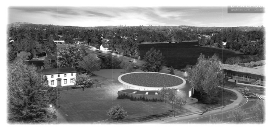
Artist's concept of the Centre located on the grounds of the historic Craigflower Manor overlooking the Gorge Waterway.

Donations can be made to help the project along. \Delta