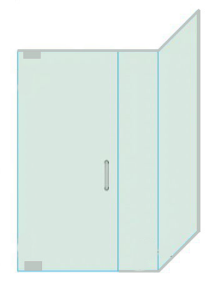
Pivot Door & Return Panel