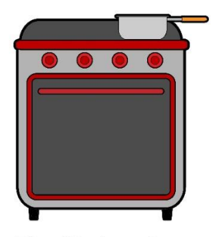
The Kitchen Stove

We need to replace our stove in the kitchen. It is over 40 years old and it is now giving us a lot of problems. The cost to repair it is high plus the parts if they can find them.