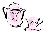
Victorian Tea at the Brick Tavern Museum.

A variety of teas were served, such as Sencha, Irish Breakfast tea, Mango, and Strawberry.