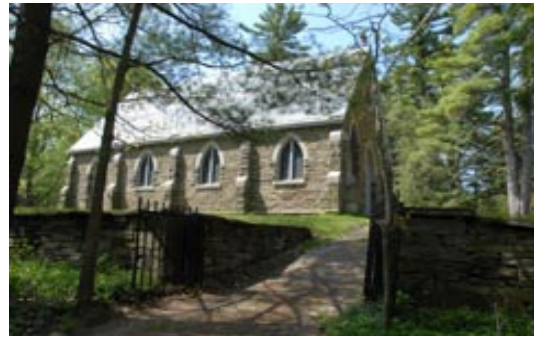
Beautiful Lawrence Chapel built in 1880.

This project, as well as the stitching course described below, is made possible, in part, with public funds from the New York State Council on the Arts' Decentralization Program adminis-