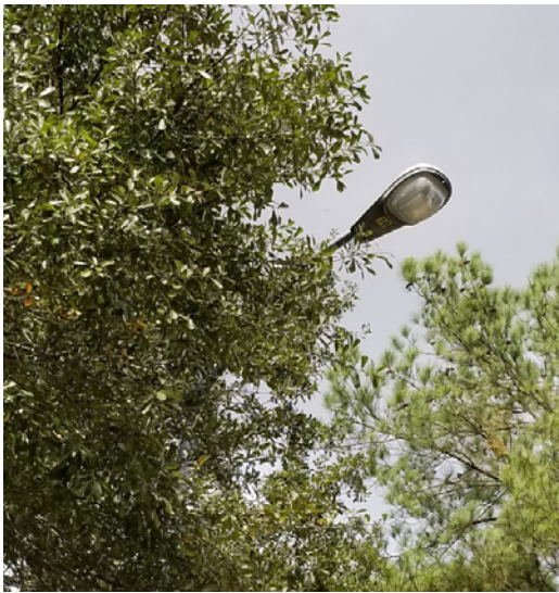
Sections 1, 2 and 3.

Street lighting improves pedestrian visibility and personal security. On streets with lots of trees, street lighting scaled to pedestrians (low lights) illuminates the sidewalks even after the trees grow big and tall. Street lighting improves safety by allowing pedestrians and motorists to see each other. It also adds to personal safety and aesthetics. While most school walking activity occurs during daylight hours, the morning school trip in the middle of winter often occurs during hours of darkness. Also many school activities occur during nighttime hours.