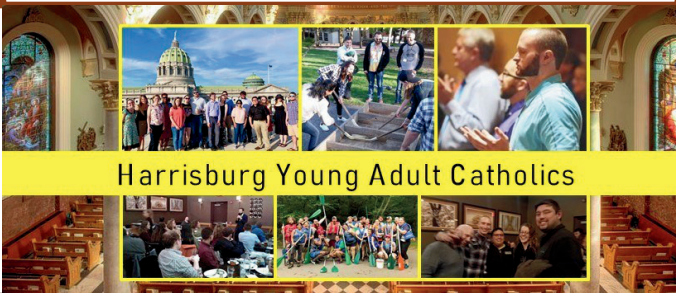
Harrisburg Young Adult Catholics

More information can be found at our Facebook group: https://www.facebook.com/groups/568131137998438/ .