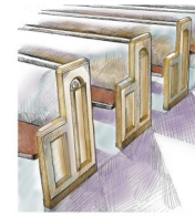
News from the Pews