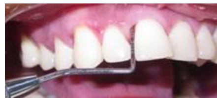
Fig 2(a, a'): periodontal probing shows 7-8mm depth