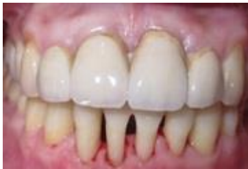
Fig 8c: after prosthodontic treatment