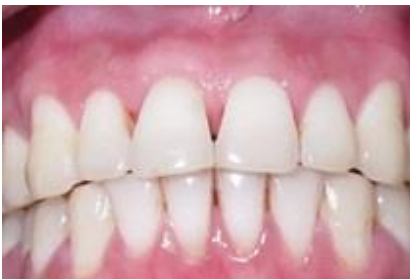
Fig 8a: Postoperative view (6month)