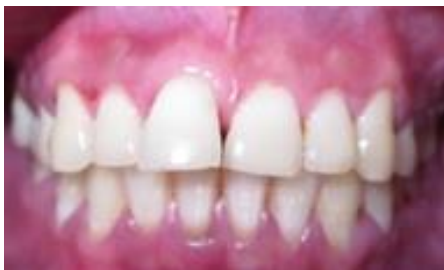
Fig 1(a, a'): Preoperative view showing labial and distal extrusion of right central incisor