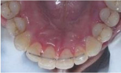
Fig 6a: orthodontic Retainer