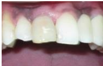
Fig 1b: Preoperative view showing labial and mesial extrusion of right central incisor