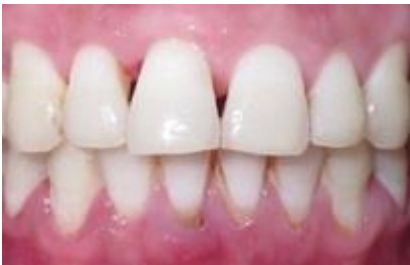
Fig 7a: Postoperative view (3month)