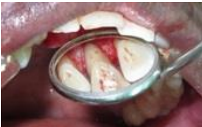
Fig 4(b, b'): periodontal probing shows 6mm depth