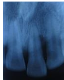
Fig 3a: Preoperative IOPA