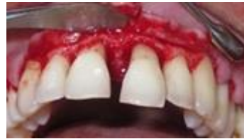
Fig 4(c, c'): papilla preservation flap and debridement