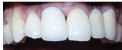
Fig 8b: PFM crown placement