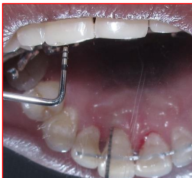
Fig 9(a): Postoperative probing depth