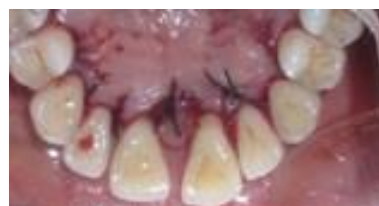
Fig 6(c, c'): Suturing done