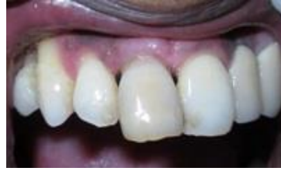
Fig 6b: Postoperative view 1 month after surgery