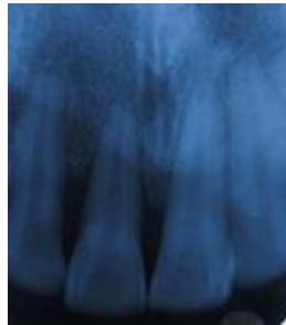
Fig 10a: Post-operative IOPA