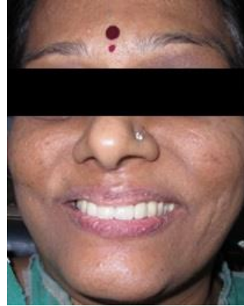
Fig 11c: Post-treatment extraoral photographs