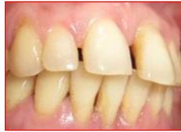
Fig 9(a, a'): Postoperative probing depth