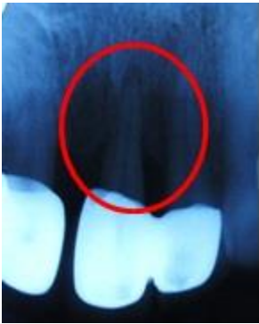
Fig 2c: IOOPA immediately after crown placement