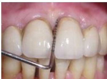
Fig 10c: postoperative probing depth (after 6month)