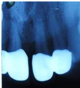
Fig 9c: IOPA after 6month