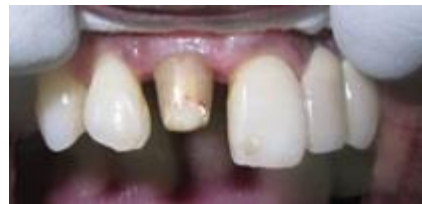
Fig 7(b, b'): Crown preparation Right central incisor