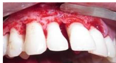
Fig 4(a, a'): Open flap surgery and debridement