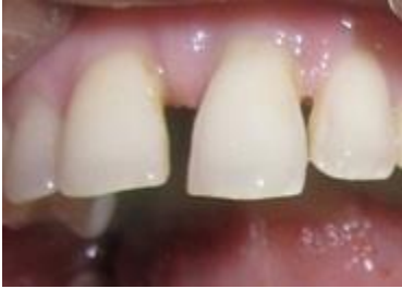
Fig 1(c, c'): Preoperative view