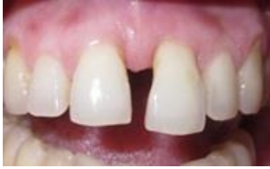
Fig 7c: postoperative view