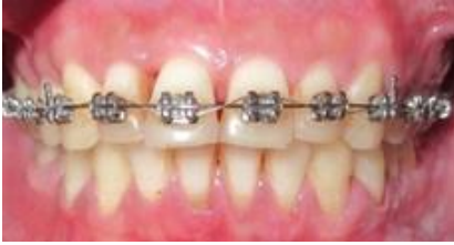
Fig5a: Orthodontic treatment