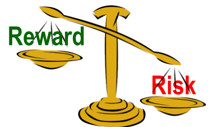
Highly Proficient Traders