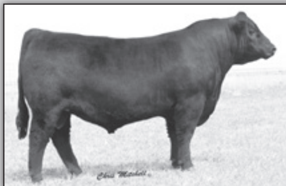
CONNEALY CONFIDENCE 0100 - Reference Sire C.