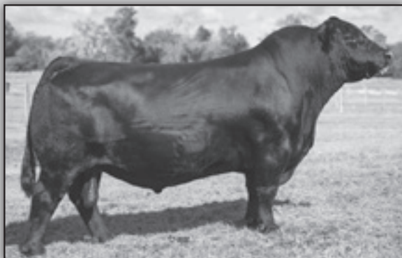
CONNEALY CAPITALIST 028 - Reference Sire B