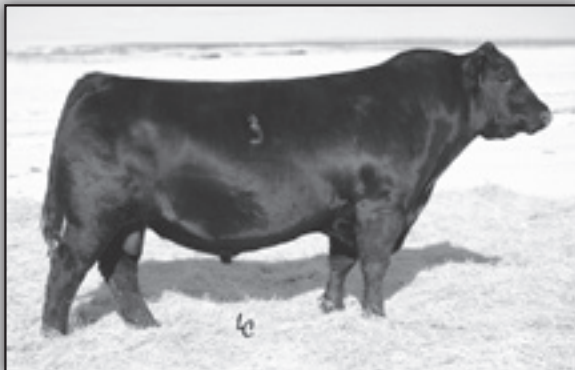
HOOVER DAM - Reference Sire D