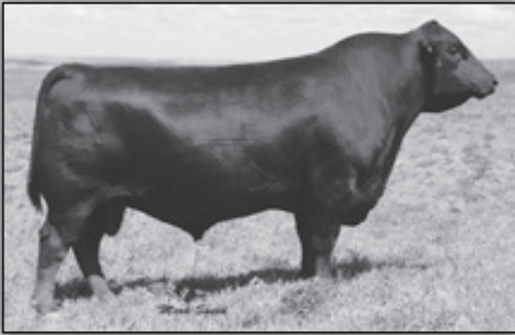
21AR ROUNDUP 7005 - Reference Sire F.