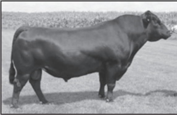
K C F BENNETT ABSOLUTE - Reference Sire E.