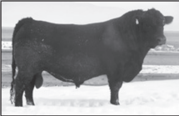
RV EXAR R013 - Reference Sire A