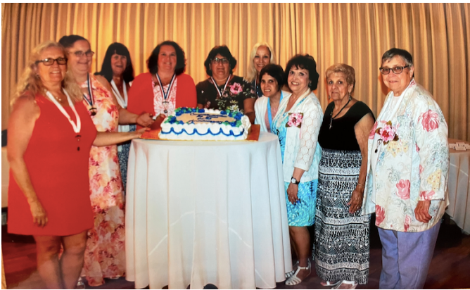
Current OLOR Columbiette Board Members & 60 th Anniversary Committee