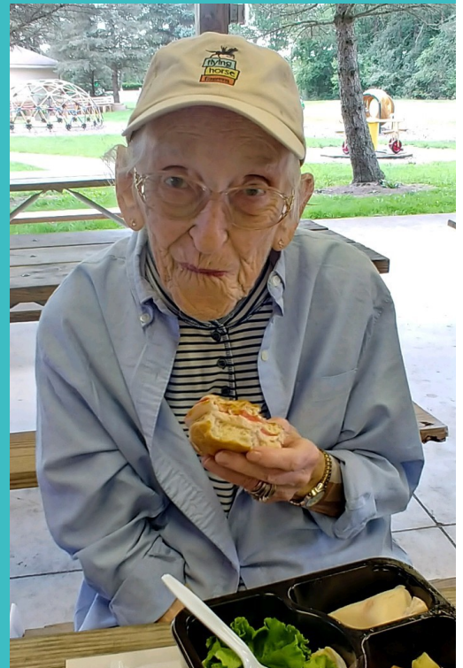
Everyone enjoying our picnic in the park and karaoke on this absolutely wonderful September day.