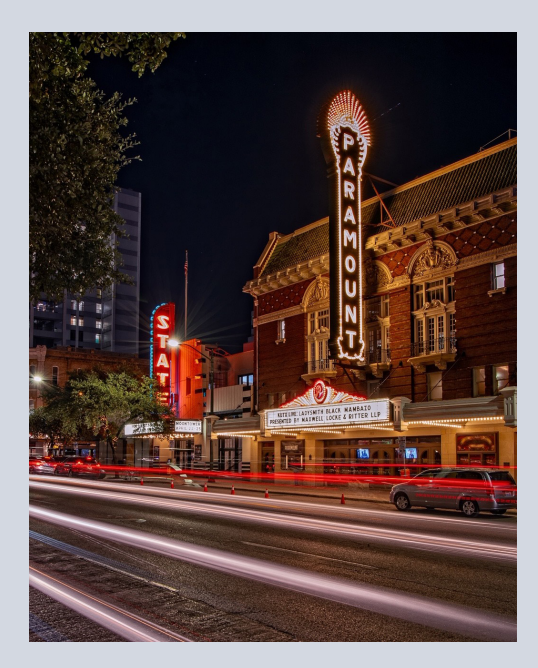
Icons - Larry Peruffo