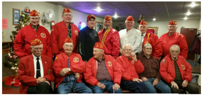
Mount Suribachi members in attendance at the Detachment Christmas Party.