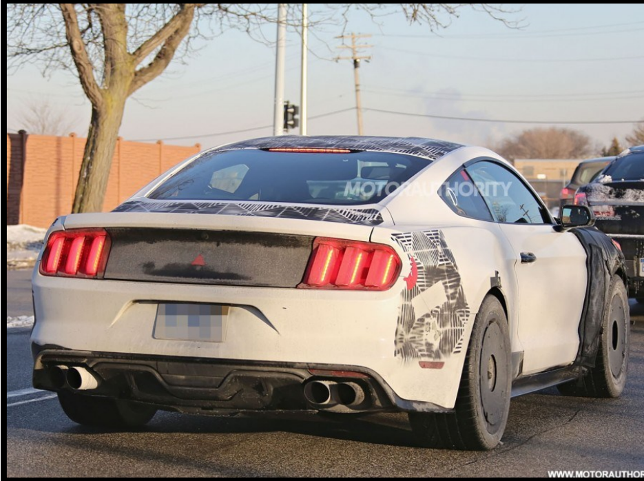
2016 Shelby GT350