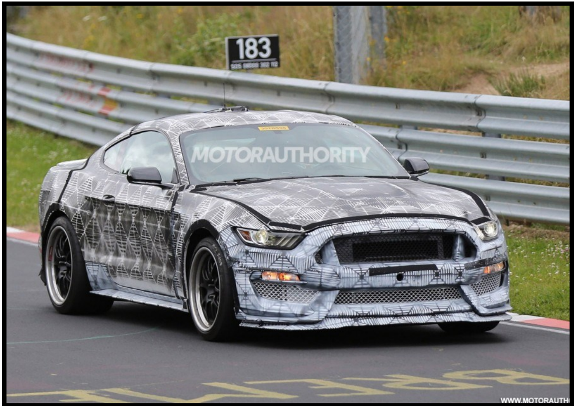
2016 Shelby GT350