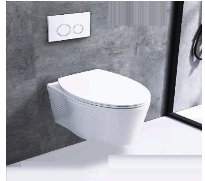
Wall Mount Closet