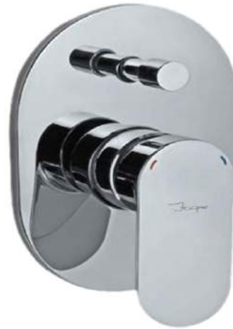
Jaquar Bathroom Fittings