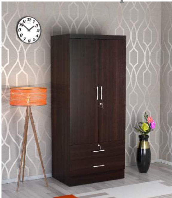
Wood Work Cupboard