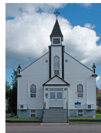
Our Lady of Mercy 11 St. Andrews Street Pointe-du-Chêne, NB