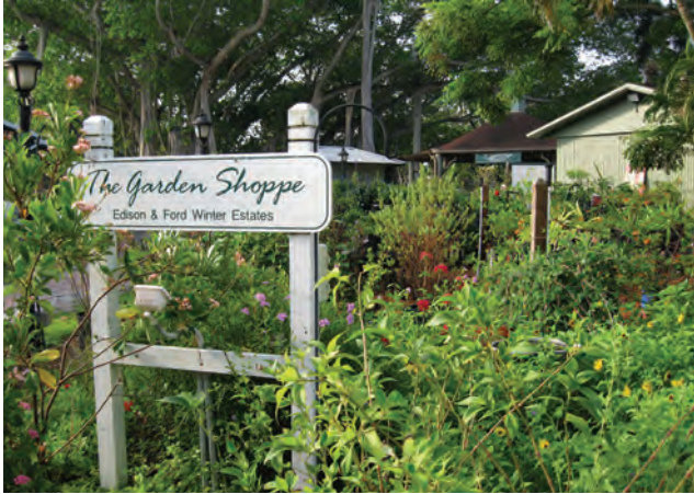
The Garden Shoppe at Edison & Ford Winter Estates has many plants and trees available for sale and demonstration gardens for planning purposes.

No garden discussion is complete without talking about insects. Many insects we find in our gardens are beneficial,