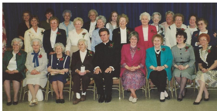
TOP at 60 th anniversary- April 28, 1996

While the fellowship aspect of the sodality is still of great importance, the goals have been expanded to provide not only physical and financial assistance to our church and its members, but on an outreach basis as well. Sto Lat!