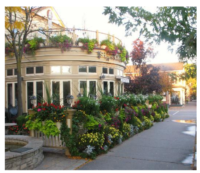
The Shaw Cafe, a George Bernard Shaw namesake, is a popular restaurant in Niagara-on-the-Lake. www.niagaralandscapes.com.)

With almost nine months before the start of the CAVORT 2012 Conference, plans have been going well. Wondering what's in store for you?