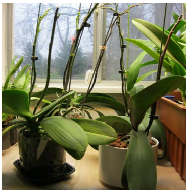
Phalaenopsis in a commercial container (right) and in a home-made container (left)