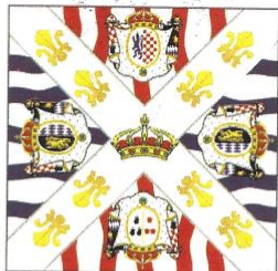
The Royal Deux-Ponts (Zweibrücken) Regimental Flag.

The French Expeditionary Forces under the Command of Comte de Rochambeau, arrived at Yorktown to assist General Washington's American Forces. General Rochambeau's forces consisted of seven regiments, one of which was the Regiment Royal Deux-Ponts, specifically requested by Rochambeau due to its fighting reputation.