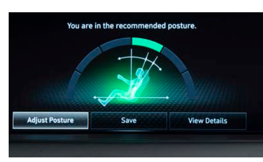
Smart Posture Care adds a new dimension of driver comfort

At Genesis, our goal is to create vehicles that appeal to guests with the highest standards and taste. With the substantially revised 2020 G90, our flagship sedan elevates the luxury experience at every level.