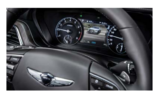
New Blind-Spot View Monitor shows a video image of neighboring vehicles

4 THE GENESIS DIFFERENCE NOVEMBER-DECEMBER 2019 THE GENESIS DIFFERENCE NOVEMBER-DECEMBER 2019 5