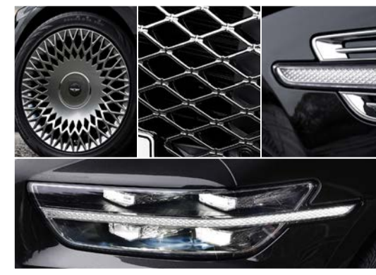
G-Matrix design elements sparkle like the facets of a diamond