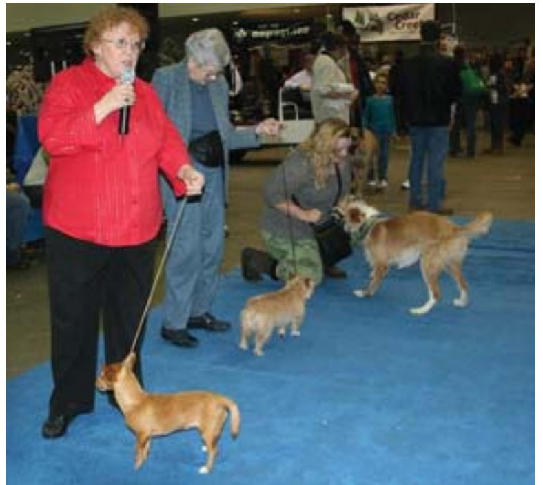
A small talk was given twice a day to introduce our breed.