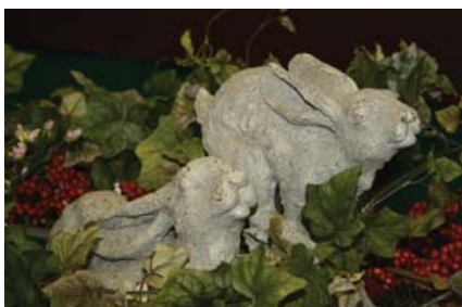
Bunnies were on site to remind us that Podengos are hunters!