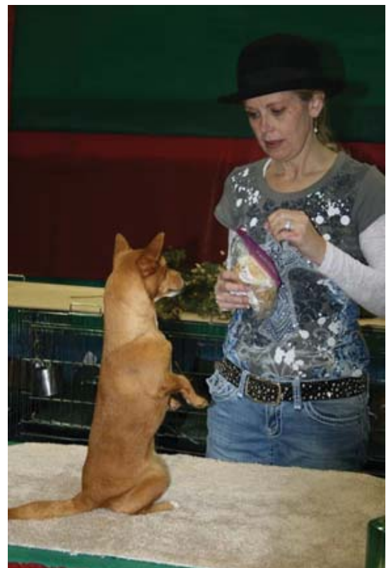
Java plays her part by charming the public