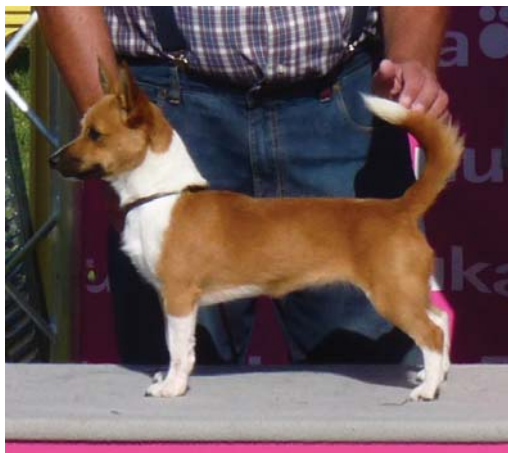
Smooth Portuguese Podengo Pequeno