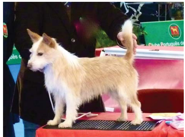
Wire Portuguese Podengo Pequeno