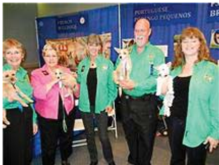
This is the photo of our Meet the Breed at the EUK National.

Last December the Pequeno were just there for Meet the Breeds. For this December we already have members with their dogs qualified to show at Eukanuba in the Misc Class. Way to go PPP owners.