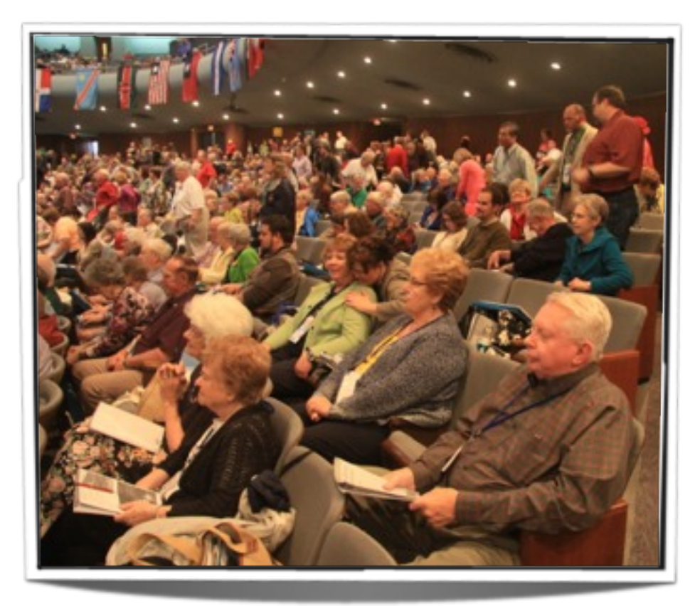
Our Inland West delegation to World and USA Conferences included members from congregations in Eastern Washington, Idaho, Montana, and Utah.

As I have readied myself for today and every day since World and USA Conference, my mind has such a peacefulness; and a connectedness. I am so thankful and excited to be a part of the sacred journey within the Community of Christ. I was so proud, and inspired by our leadership and by the community at large —we truly did have faithful listening and faithful disagreement on the resolutions and decisions made. We listened, we spoke, we worshiped, and we honored each other. It was a beautiful God thing!