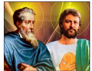
Feast Day: October 28